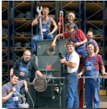
Also well-equipped for large-scale operations

2010: 40 employees, including 4 foremen, get small and large motors running again (0.06 - 6000 kW).