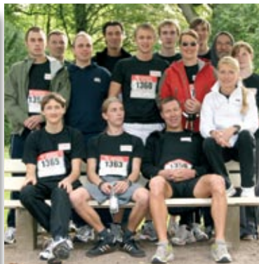
Corporate challenge fun run 2009