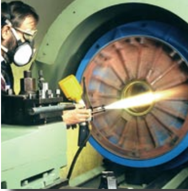
Powder flame spraying