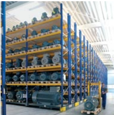
New construction of hall 3 in 2005: „hobby room“ with 3,000 pallet spaces