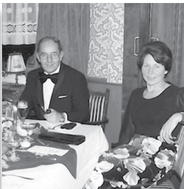
25th company anniversary 1975