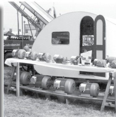
Company presentation 1960