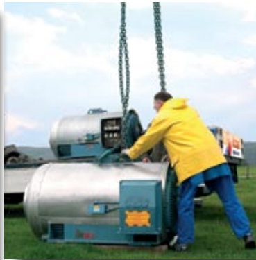
Replacement 1 MW wind generator rotor