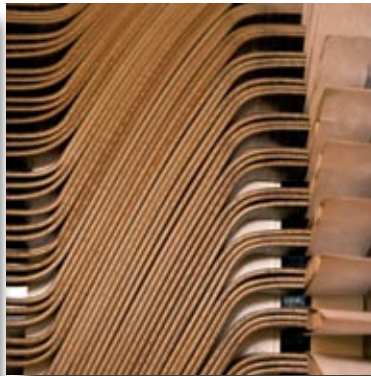
Slip ring rotor winding