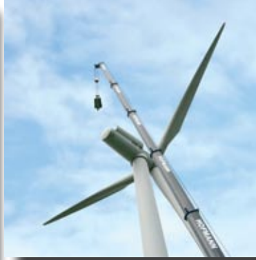
Replacement wind generator