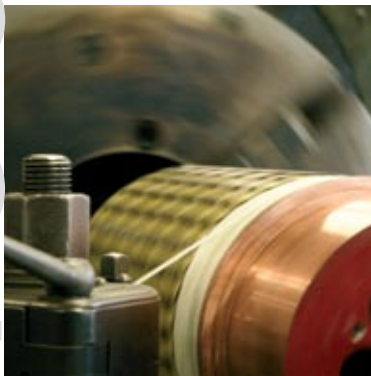
Applying the bandage