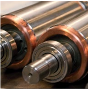
Energy-saving rotors and motors