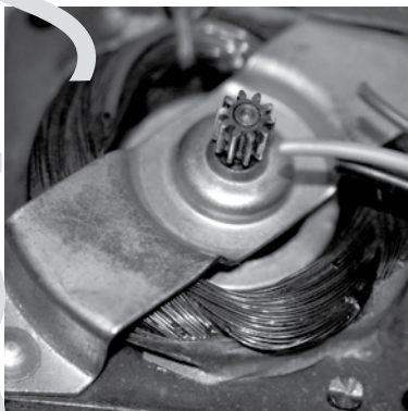
Production: 1,000 antenna rotating motors a day