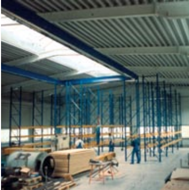
New construction of hall 2 in 1998: creating 500 pallet spaces.

Focus on the strengths: solution-orientated consulting, service and repairs.