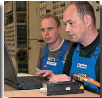
Servo motor testing