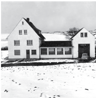
New company premises 1954

Repair and sale of electric motors; development, production and sale of special motors.