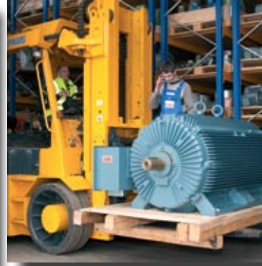
16t lift truck