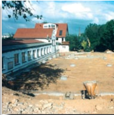
Laying of the foundation stone 1998